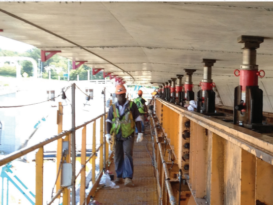
(42) HLN5508 cylinders lifting the Jordan Bridge in Cheasapeake, VA.